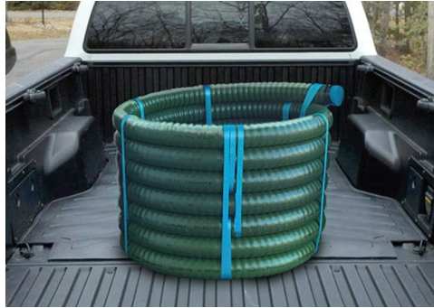
25 mm ThermoPEX is easier to transport