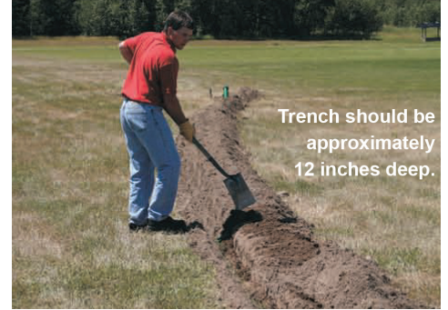
ThermoPEX only needs a narrow trench for installation

ENERGY EFFICIENT: ThermoPEX saves energy and maximizes efficiency. The corrugated waterproof jacket keeps moisture out and inner construction locks the heat in. Greater system efficiency maximizes the delivery of heat from each pound of wood so you will burn less wood compared to a system using inferior insulated piping.